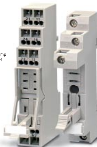
P2RF-E Screw Terminal Socket